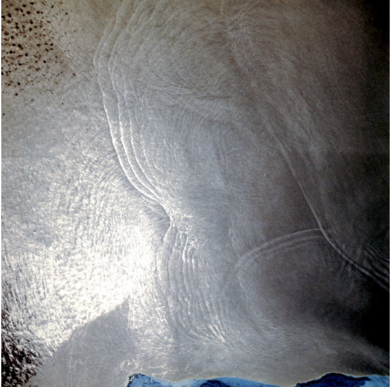
Figure 1. Space Shuttle Photograph (STS026-042-015) acquired October 1, 1988, 10:15 GMT showing a variety of internal wave signatures. Image is centered near 12.0^{\circ} N. latitude, 51.0^{\circ} W. longitude.