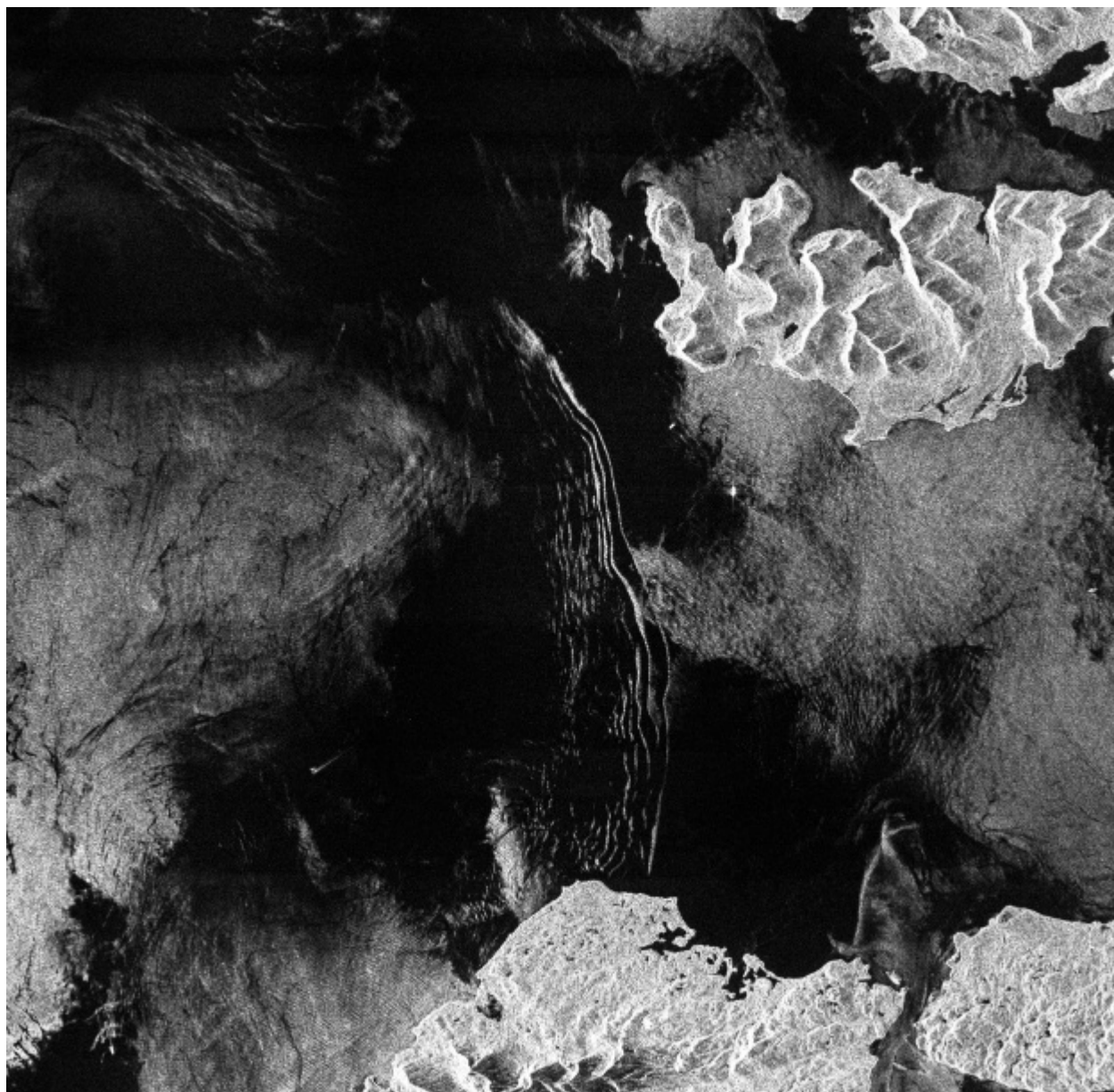
Figure 1. Radarsat standard mode image showing internal wave signatures in Prince William Sound, Alaska. Image was acquired on June 11, 1998, 03:07 GMT. Image is 41 km x 41 km centered at 60.5° N., 146.6° W.